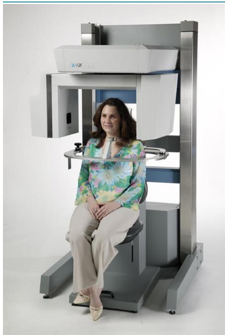
Chart 3: I-CAT

Nevertheless, at the list price of +US$6,000 for the planning software (which includes the Procera platform and conversion software), we feel the company’s top line may continue to benefit from some “capital sales” over the shorter-term, while longer-term sales will benefit from NobelGuide “consumable revenues.”