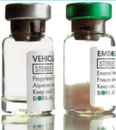
Chart 5: Straumann's Emdogain

Thirty-two adult patients scheduled for tooth replacement with dental implants accepted to participate. Following insertion of a transmucosal implant into the extraction site, the subjects were assigned to one of 2 treatment alternatives of the remaining bone defect around the implant: 1) the residual bone defects were filled in Enamel Matrix Derivate (EMD); or 2) the residual bone defects were covered with an absorbable membrane. At 12-month follow-up the membrane group showed a significantly lower mean probing attachment level than the EMD group at proximal, buccal and lingual site, which was statistically significant. It was concluded that the membrane group obtained more favorable results in terms of both probing attachment level and per-implant position of soft tissues compared to EMD group. The use of bioabsorbable membrane around immediately placed transmucosal implants was able to enhance soft and hard tissue healing and might be the advisable treatment choice particularly in areas with high esthetic demands.