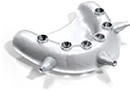
Chart 2: NobelGuide