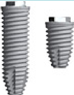
Chart 1: NobelSpeedy Groovy & Shorty