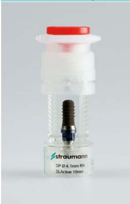
Chart 4: Straumann's SLActive Implant

During the AO meeting, Straumann launched its new SLActive implant for the U.S. market, which as planned, is 6 months behind Europe. Interestingly, Straumann's marketing materials for the U.S. have become a little broader than when the technology was introduced at the ITI World Congress in Munich in September of 2005. Rather than marketing it for 1/3 rd of the indications, it seems that Straumann is now suggesting it is suitable for all indications. We welcome this broader indication from a financial perspective, as we felt that STMN was unnecessary limiting the penetration of its new SLActive implant product.